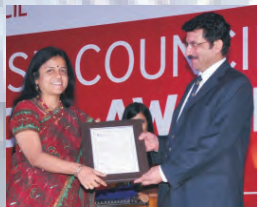
International School Award...