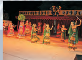
Primary Annual Day...